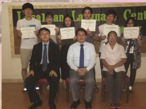
Solo students from various Korean Universities during the LLC Graduation.