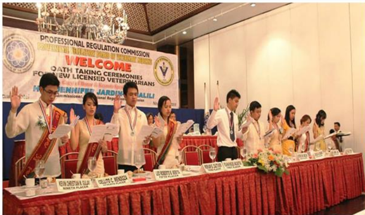
November 3, 2013 – Manila Hotel, Roxas Boulevard, Manila