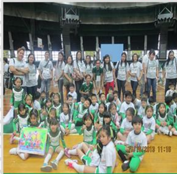
The cool preschoolers with their cheerers and mentors in the Basic Education Department.

Little Archers' Olympics is an annual sports event which provides a venue for Lasallian preschool students to meet together as one family and have fun while gaining more friends. This year's Olympics was hosted by La Salle Green Hills on October 18.