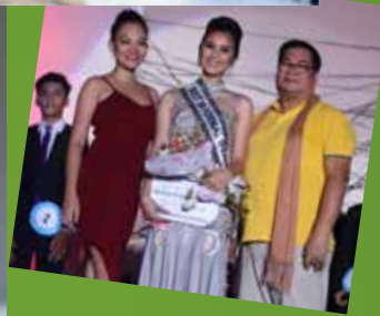
The four-day celebration featured a food and items fair, business and marketing seminars, a sports fest, a boodle fight, an inter-collegiate flair-tending competition, a film showing, and the prestigious Mr. & Ms. CBM 2016 Pageant.