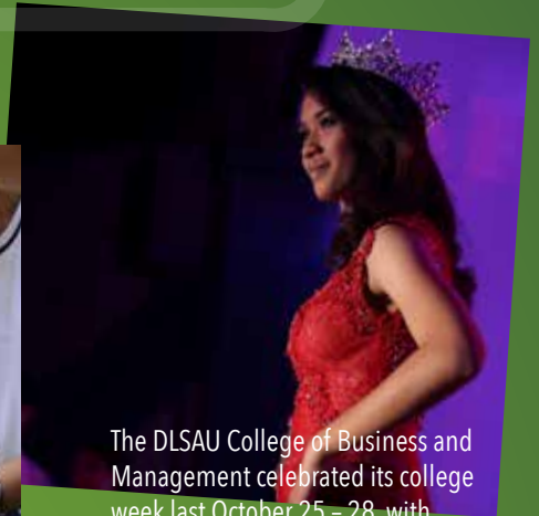
The DLSAU College of Business and Management celebrated its college week last October 25 – 28, with the theme "Surpassing the Typical: iCBeyond".