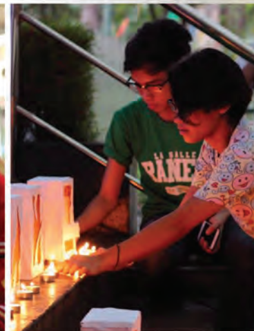
Candle lighting