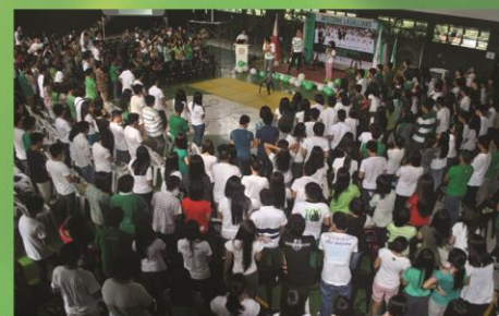
Freshmen students, SY 2014-2015

The Student Services Office, in cooperation with the Supreme Student Council and the Admissions Office, organized the event which included the introduction of University Administrators and key personnel and a tour of the campus to help the new students to get familiar with the different faces and places around the University.