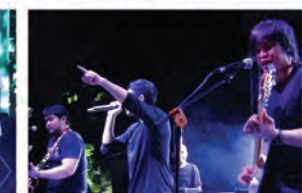
Students' Night: #DrizzleLaSalleAraneta