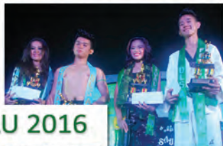
Mr. and Ms. DLSAU 2016