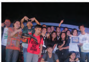
HATAW NA! Inter-High School Hip Hop Dance Competition