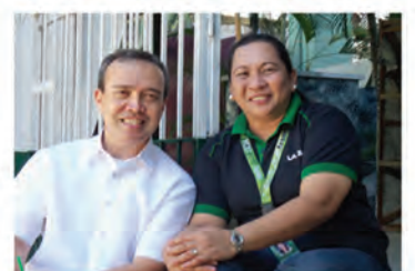
Basic Education Department Field Demonstration