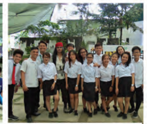
Opening of the 10ne La Salle Inter-College 2016