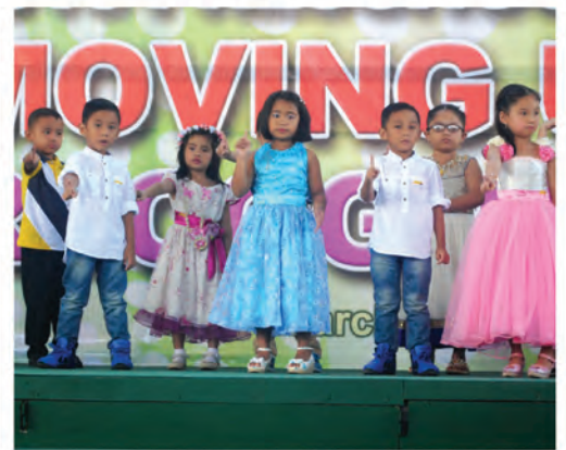
Preschool Moving Up & Recognition