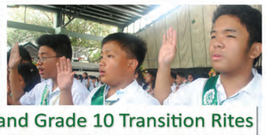
Grade 6 Graduation and Grade 10 Transition Rites